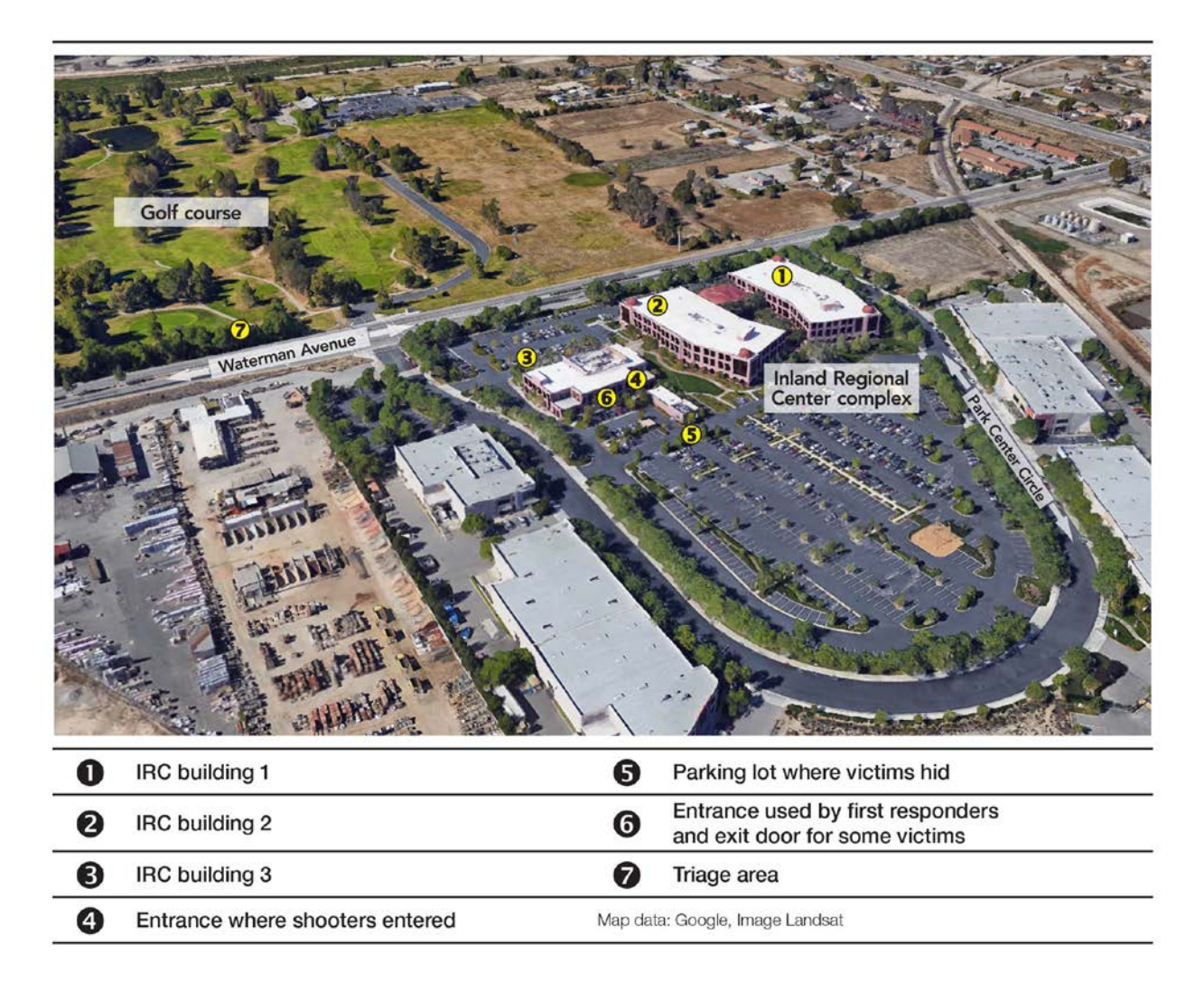
Figure 2. Inland Regional Center complex

Figure 2 shows the Inland Regional Center complex and the locations of relevant buildings, entry points, and other important locations.