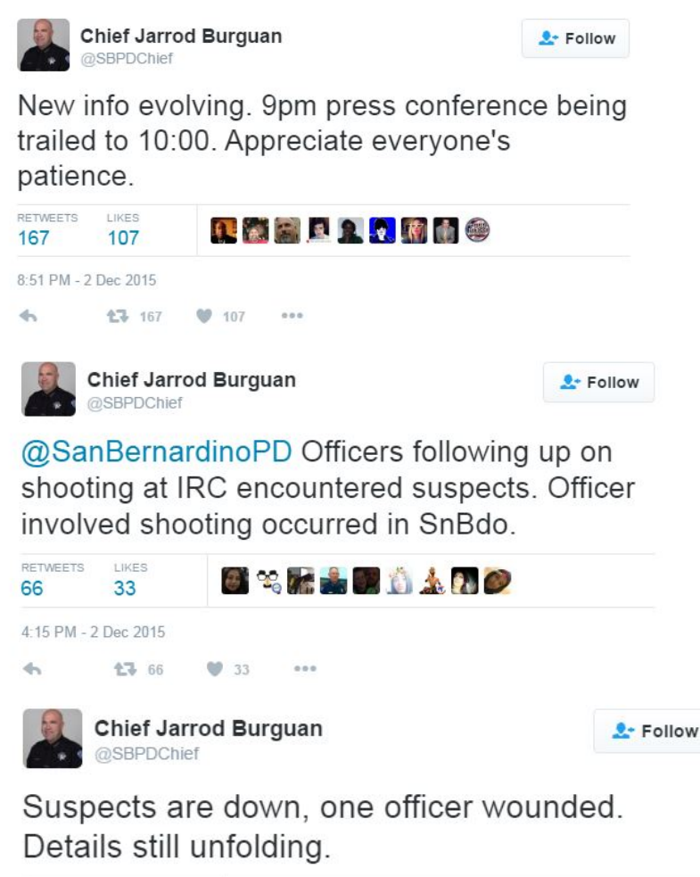
Figure 4. Tweets from SBPD Chief Jarrod Burguan