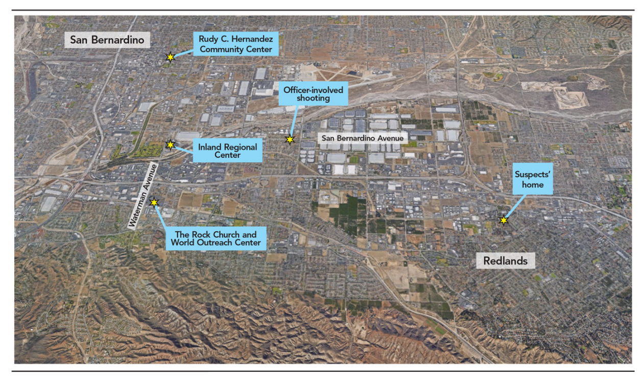
Figure 5. Relative locations of events and staging areas